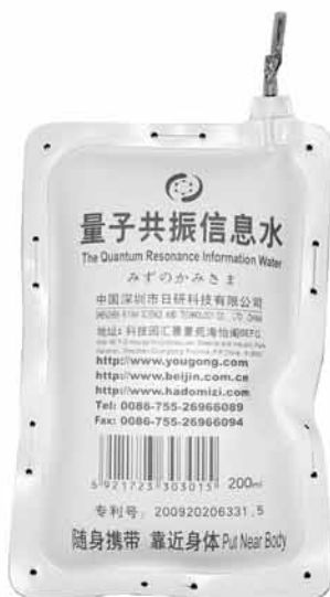
Bag of 200 ml