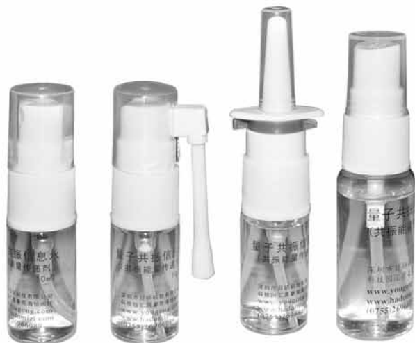
Small spray bottle of 10 ml