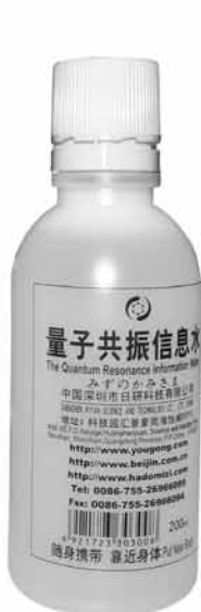
Bottle of 200 ml